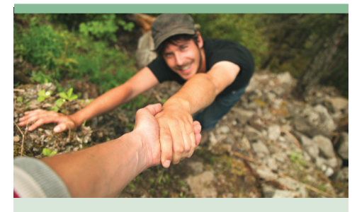
Our student advisors will track your progress and proactively reach out if you need help!

You will learn the necessary skills to function as a vital member of the healthcare team in a hospital setting, clinic or physician's office as you prepare for a career as Certified Clinical Medical Assistant (CCMA), and the national certification exam.